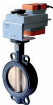
Seawater Application DN50...800