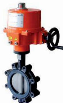
PN25 Butterfly Valve DN50...500