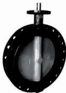
Large size Butterfly Valve DN600...1200