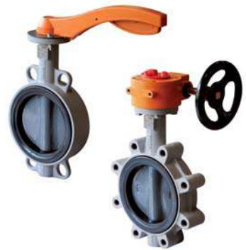
Manual Butterfly Valve DN50...500